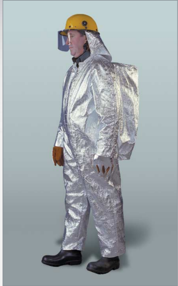
Aluminised Rayon one piece suit Yellow safety helmet complete with aluminised rayon neck curtain