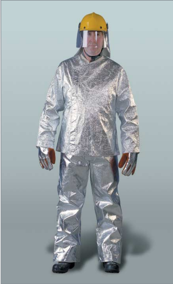
Aluminised rayon jacket Aluminised rayon trousers Yellow safety helmet complete with aluminised rayon neck curtain