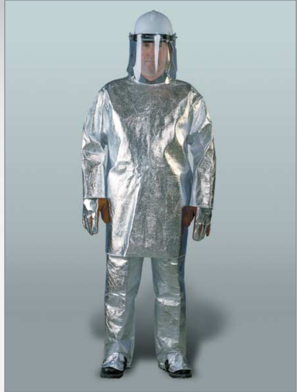
Lightweight polycarbonate safety helmet with clear visor Aluminised knee length back fastening smock