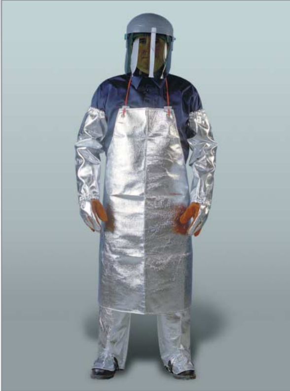
Ratchet browband Navy Proban Shirt Aluminised bib top apron