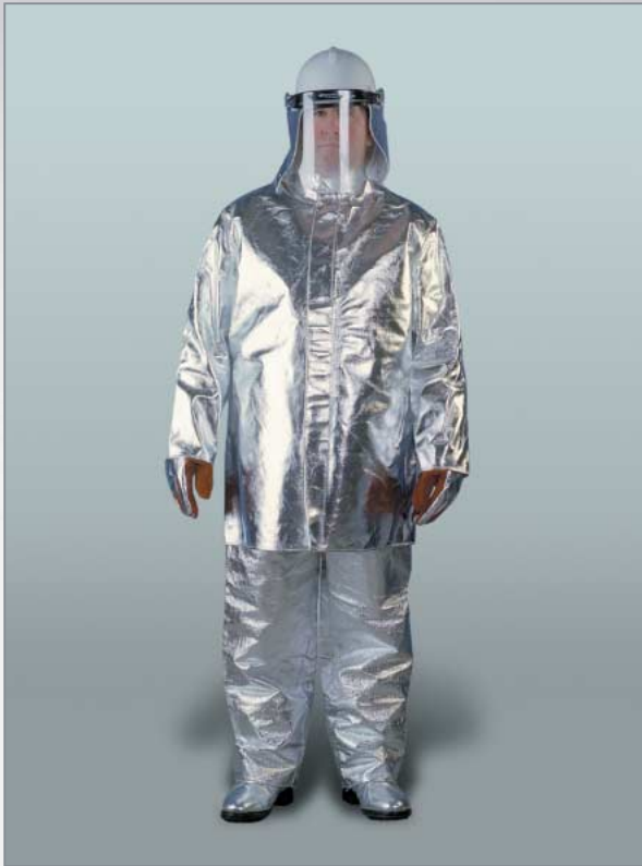
Lightweight polycarbonate safety helmet Aluminised jacket Aluminised trousers Aluminised gloves Aluminised boots