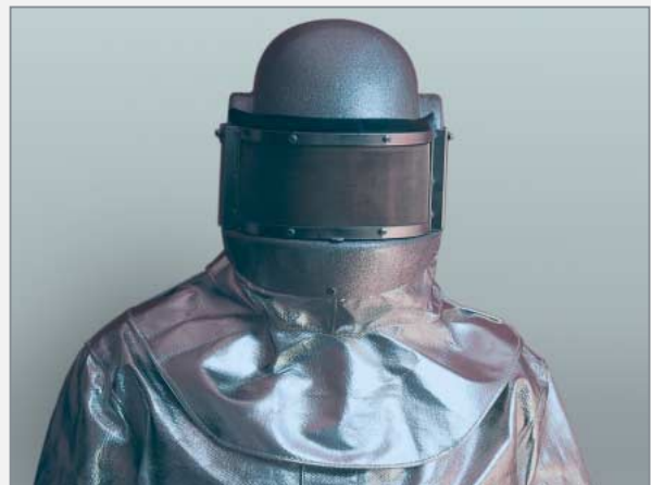
Aluminised glass fibre helmet (ref: PS6)