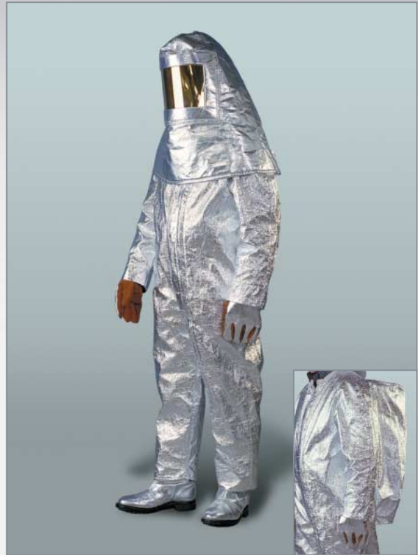
Aluminised hood complete with visor Aluminised one-piece suit (b/a pouch also available). Aluminised gloves Aluminised boots